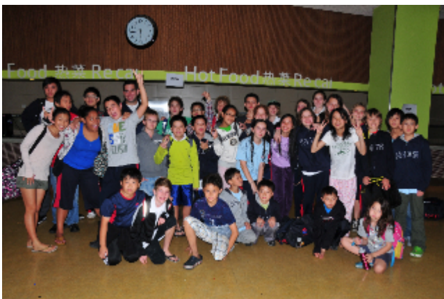
Congratulations to the SSIS Swim Team and a successful meet.