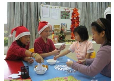
Unser „Auftritt“ in der Nursery